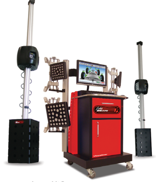
Arago V3D Imaging Alignment System EEWA550AL22