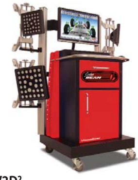
V3D<sup>2</sup> Imaging Alignment System EEWA5460AL22