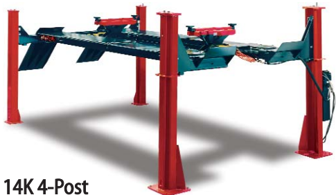
Open-Front Alignment Lifts 00044214Q00 (172"Wheel Base) 00044214QE0 (210"Wheel Base)