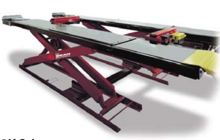
12K Scissor Alignment Lift 4812205AF (172"Wheel Base)

Note: Pictures may display optional accessories. Actual product appearance may vary. Accessories apply to current production units only.